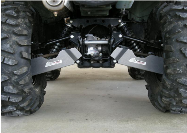
HONDA RANCHER 420 H-SG-R-420